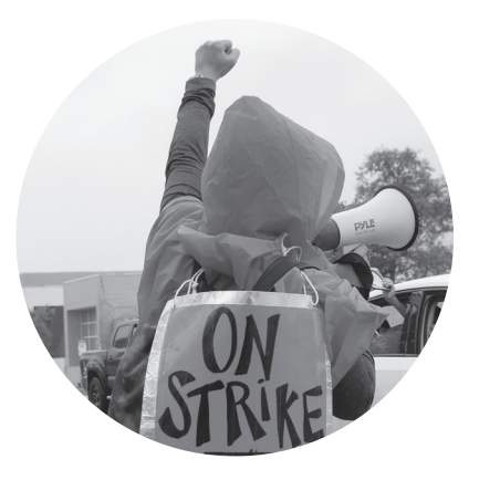
Organize with others in your union, industry, or campaign. Face-to-face meetings to share tactics and swap notes are the heart of the Labor Notes Conference. Join an existing industry, union, or caucus meeting—or contact us to set one up.

More than 200 meetings and workshops include creative organizing tactics, beating apathy, running for local union office, winning contract campaigns, bargaining over technology, understanding the economy, life after "right to work," and reviving the strike.